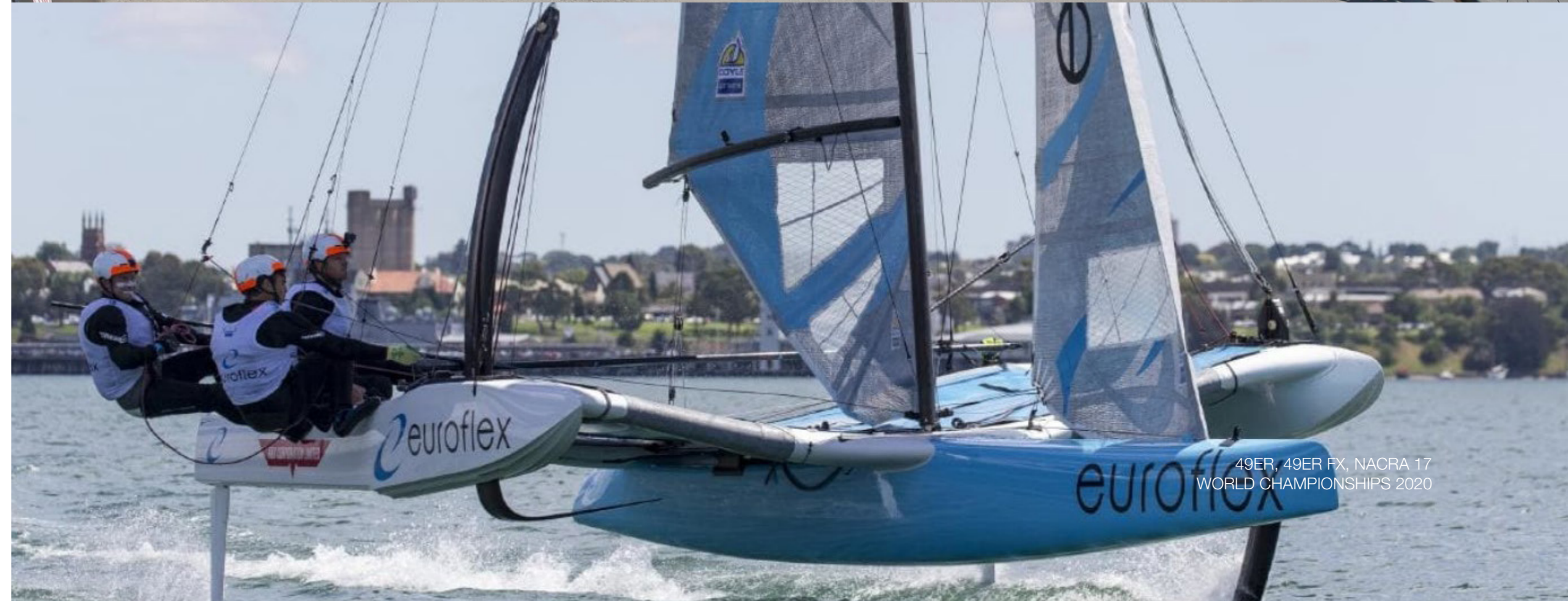
49ER, 49ER FX, NACRA 17 WORLD CHAMPIONSHIPS 2020